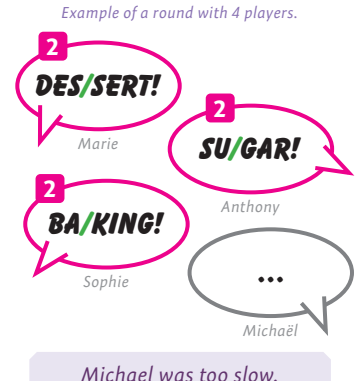
He loses this round.